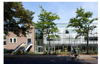
Het Rijks Vocational School, Nijmegen, NL