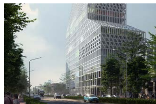
Futian Civic Cultural Centre, Shenzhen, China