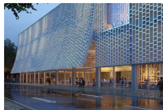
Macau Central Library, China