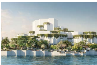
Natural History Museum Abu Dhabi, United Arab Emirates