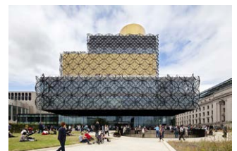
Library of Birmingham integrated with the REP Theatre, Birmingham, UK