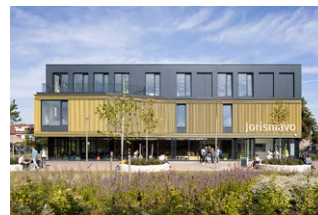
Jorismavo Secondary School, Nijmegen, NL