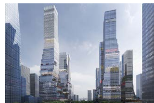
Shenzhen North Station Urban Design, Shenzhen, China